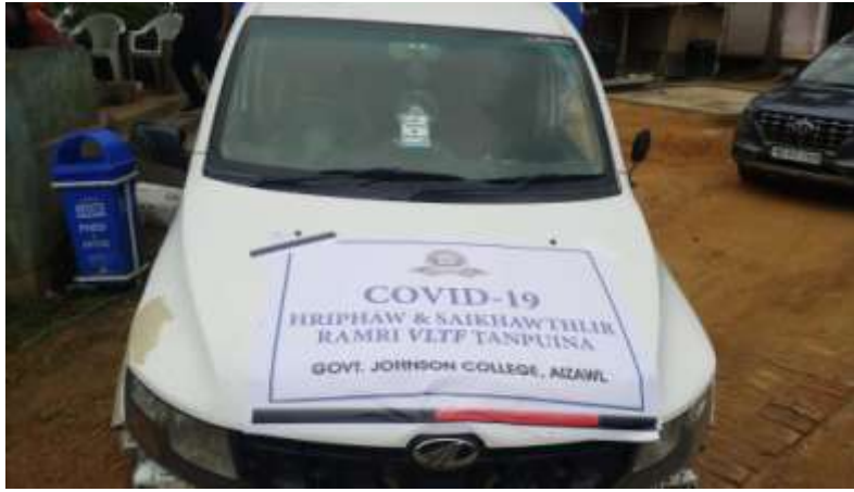
Adopted Maubuang Village Covid Relief