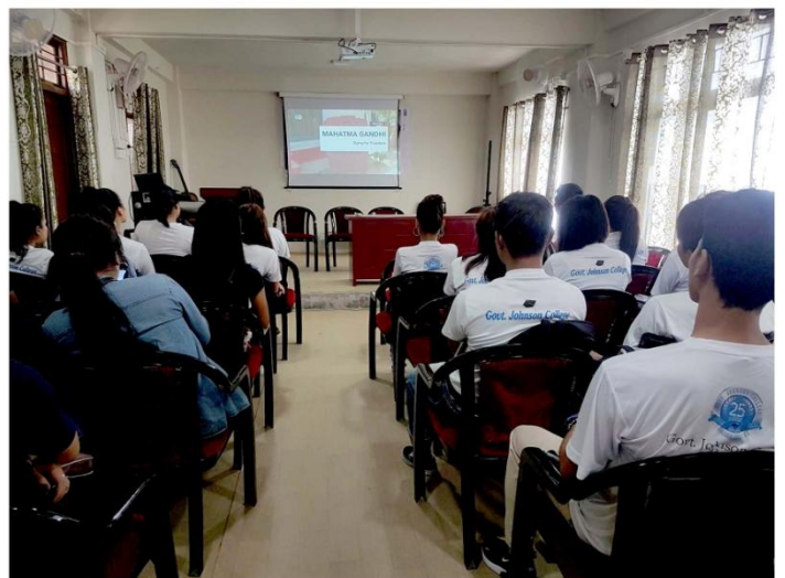
Students watching the documentary film - 'MAHATMA GANDHI-Dying for Freedom'