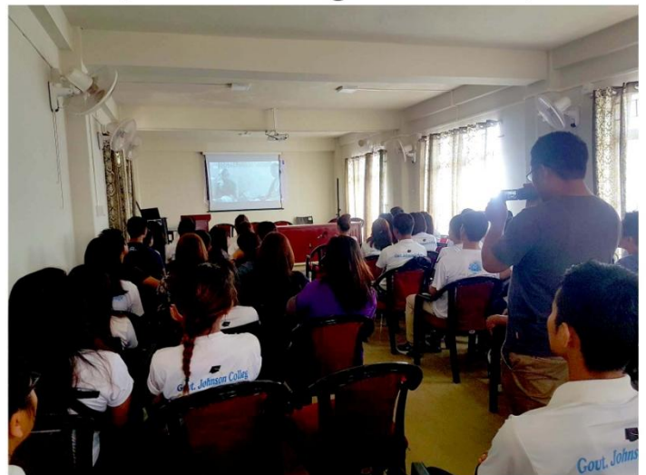
Students watching a documentary film on Mahatma Gandhi