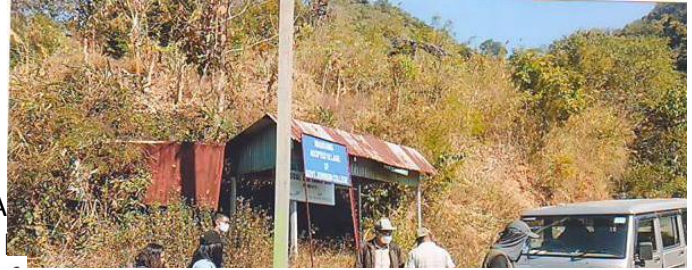
Commemoration of 150 th Birth Anniversary of Mahatma Gandhi Govt. Johnson College 1 st October, 2018