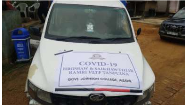
Adopted Maubuang Village Covid Relief